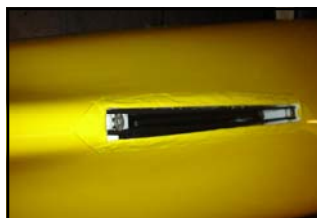
Gelcoat around finished skeg