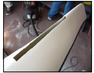
Skeg box cut out in hull

Tip! Cut the hole on the small size and clean up the edges so that the new skeg box has a tight fit: the tighter the fit now the less finishing later on.