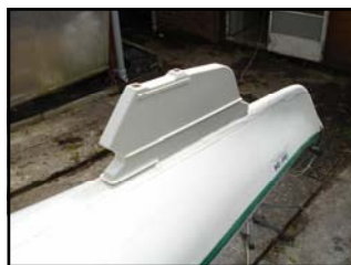
Skeg box positioned for marking out