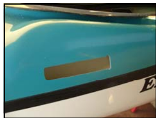
Glide box cut out on deck