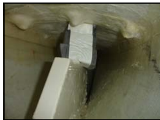
Skeg box wedged in hull with rubber blocks