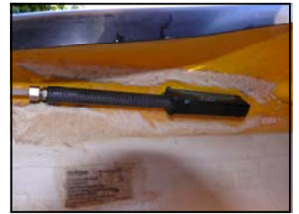
Glide tube fitted to glide box as seen from inside cockpit