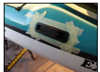
Glide box in place in deck