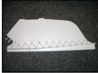
Skeg box: hatching shows where to apply cement