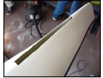
Skeg box cut out in hull

Tip! Cut the hole on the small size and clean up the edges so that the new skeg box has a tight fit: the tighter the fit now the less finishing later on.