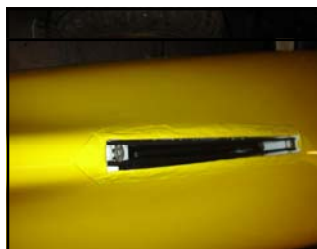
Gelcoat around finished skeg