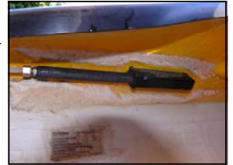
Glide tube fitted to glide box as seen from inside cockpit